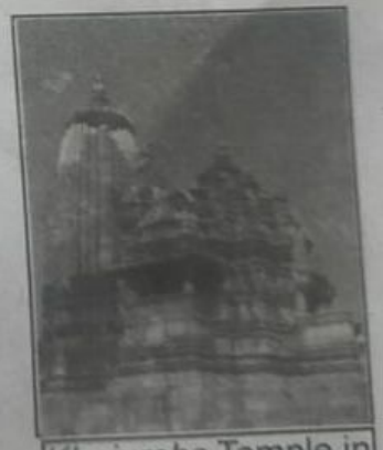
Khajuraho Temple in Madhya Pradesh.