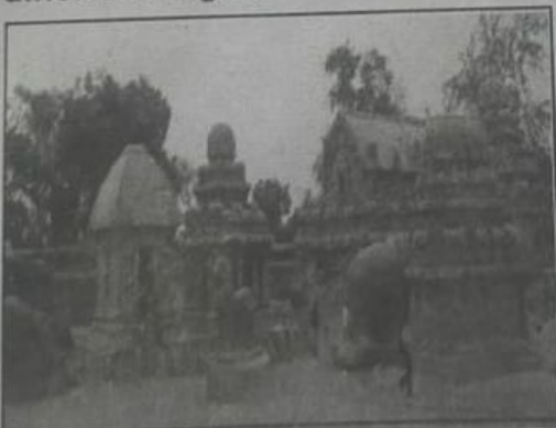
'Pancharathas' in Mahabalipuram

The contemporary style of temple architecture in India has developed through different stages.