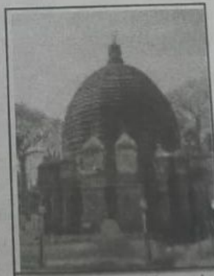
Kamakhya Temple in Assam